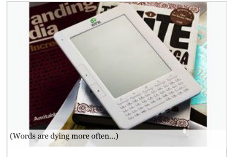
(Words are dying more often...)

WASHINGTON: Words are dying more often in the past 10 to 20 years than they had in all the time measured before while new entries into languages are becoming less common, both perhaps because of digital spell-checking, according to a new study.