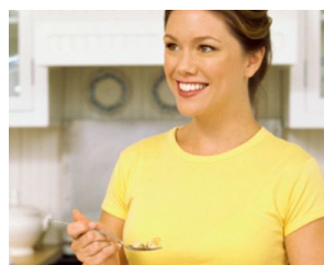
Power diet for quick weight loss