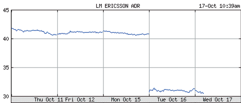
Figure 2: A 25% Gap in Ericsson, one of the Most Liquid Stocks in the World. Such move can dominate hundreds of weeks of dynamic hedging.

offsetting trades. For without offsetting trades, we doubt traders would be able to produce a position beyond a minimum (and negligible) size as dynamic hedging not possible. (Again we are not aware of many non-blownup option traders and institutions who have managed to operate in the vacuum of the Black Scholes-Merton argument). It is to the impossibility of such hedging that we turn next.