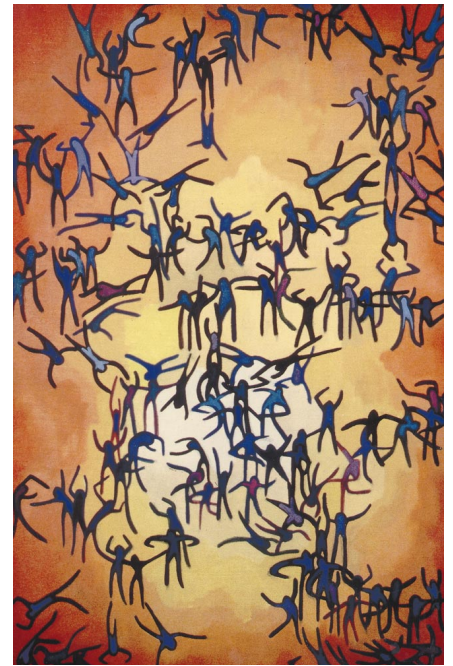
Figure 1 It’s a small world: social networks have small average path lengths between connections and show a large degree of clustering. Painting by Idahlia Stanley.

partners, k_{\text{tot}} , in the respondent’s life up to the time of the survey. This value is not relevant to the instantaneous structure of the network, but may help to elucidate the mechanisms responsible for the distribution of number of partners. Figure 2b shows the cumulative distribution, P(k_{\text{tot}}) : for k_{\text{tot}} > 20 , the data follow a straight line in a double-logarithmic plot, which is consistent with a power-law dependence in the tails of the distribution.